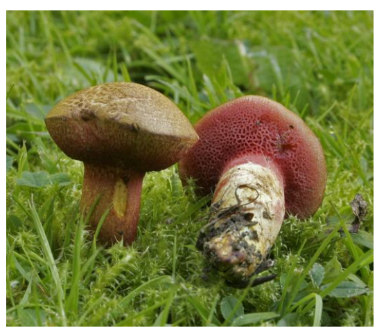
Fig. 15 Rubinoboletus rubinus

This species is included on the recent Red Data List as vulnerable. It is mycorrhizal with either Oak or Beech. A thermophilous Bolete preferring older woodlands. This is a new record for Hampstead Heath proper, although I have recorded it from Kenwood. There are 138 records on the FRDBI with only three (mine) from Middlesex.