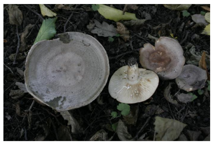
Fig.12 Lactarius circellatus

An occasional yet widespread species that is mycorrhizal with Hornbeam and very occasionally Hazel. A very healthy population thrives with the Hornbeam up alongside the Pryor's Flats. It was picked up on the survey during September through to November 2013. There are currently 325 records of this on the FRDBI out of which 10 (mine) are from Middlesex and Hampstead Heath.