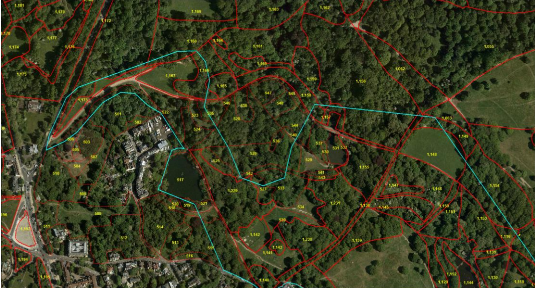
Fig 1 & 1b Biological Recording Maps of compartments used for survey