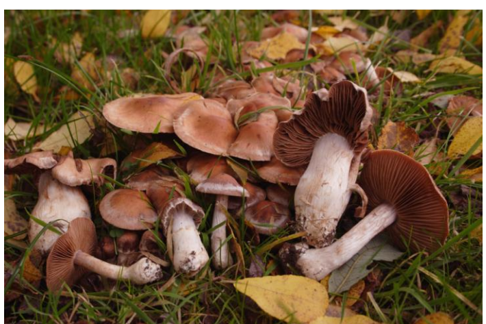
Fig. 16 Cortinarius saturninus

A rarely recorded yet widespread mycorrhizal species associated with a variety of deciduous trees especially Willow and Hawthorn. This record was found with a lone Willow tree situated on the north-east corner of Mixed Bathing Pond. This is only the seventh record for this species in Middlesex among 141 records for Great Britain and Ireland in the FRDBI.