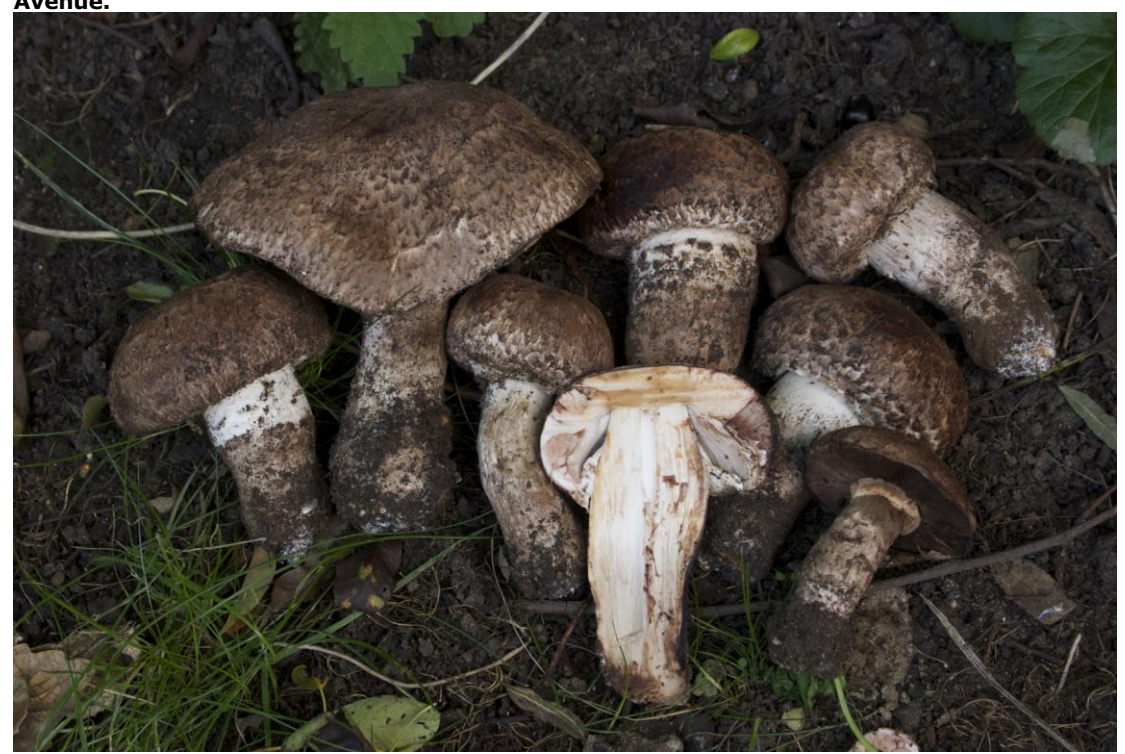
Fig. 18 Agaricus cappellianus

A rarely reported species that has undergone a few name changes over the years, such as Agaricus vaporarius and Agaricus subperonatus the latter of which some authors may regard as a 'good species' its own right. This record was from around the base of one of the old Willow trees bordering the Highgate Pond 2. There are only two records from Middlesex on the FRDBI out 139 in total, both are mine and one of these is from the Lime Avenue.