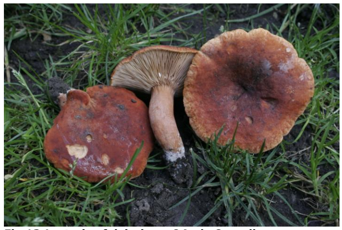
Fig.13 Lactarius fulvissimus

This is a striking mycorrhizal species of 'MilkCap' with only twelve records (mine from Hampstead Heath) out of a total of 671 records on the FRDBI. It is considered by the Checklist of British & Irish Basidiomycota to be occasional and possibly only locally frequent. It is often found with the Hornbeam or Lime next to the Pryor's Flats on this occasion it was recorded from the border of the woodland just opposite the kiddies play area south of the Vale of Health Pond.