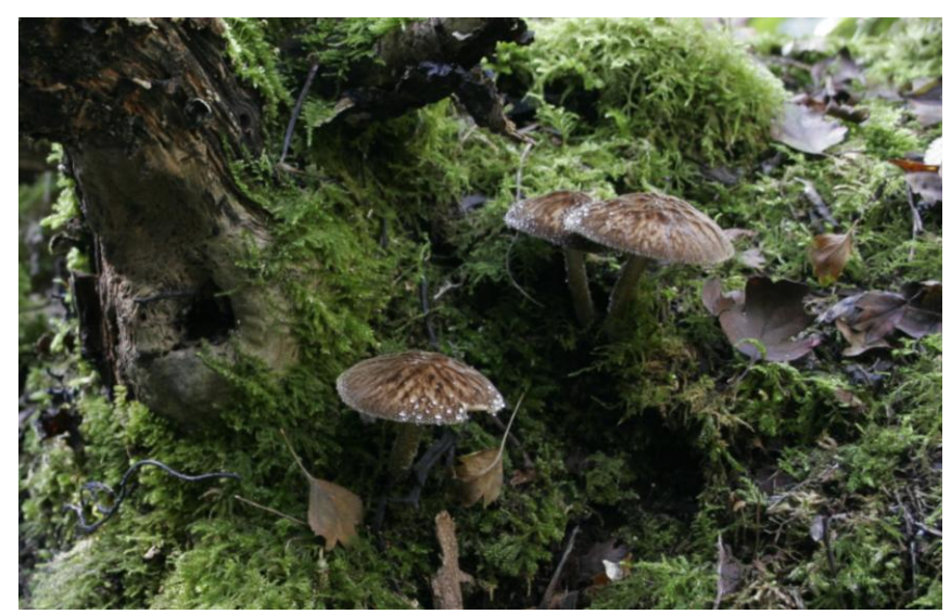
Fig.14 Pluteus umbrosus

An occasional yet widespread, saprophytic species, often on very decayed and large chunks of Elm or Beech. It was difficult to ascertain exactly which tree this was growing on but I believe it was either Elm or Poplar due to the surrounding trees and other fallen trees. A beautiful species with only eleven out of 576 records on the FRDBI originating from Middlesex, nine of these are mine from the Heath.