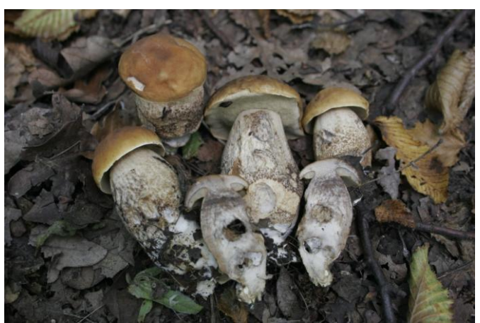
Fig.11 Leccinum crocipodium

An occasional yet widespread species of least concern on the Bolete Red Data List. All the same this is a good record. In fact I have not recorded this from the Heath proper, only from Kenwood. There seemed to be a good population thriving in this area. It is a species that is mycorrhizal with Oak, Quercus sp. Currently there are 322 records on the FRDBI.