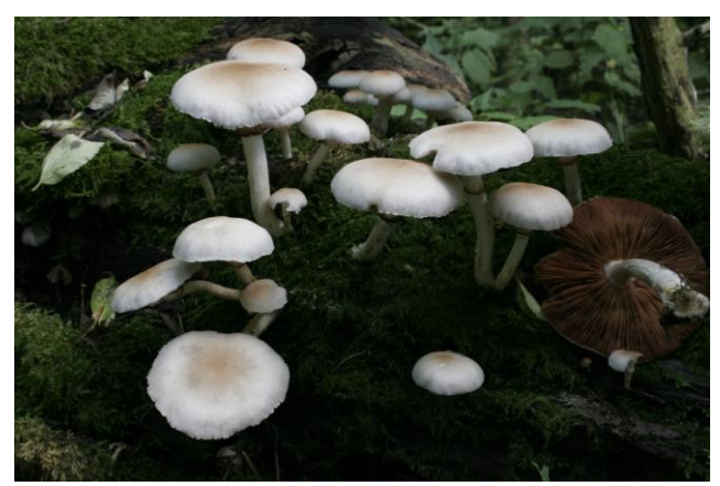
Fig. 17 Agrocybe cylindracea

A saprophytic species fruiting from lesions, knot holes or rotten sections of live standing or dead fallen Poplar or Willow trees and, more rarely Elder. It often also fruits from around the base of otherwise healthy looking trees. An occasional species with a south-south western biased, rarely reported elsewhere. There are 386 records on the FRDBI with just 28 from Middlesex, with just four, which are mine, from the Heath.