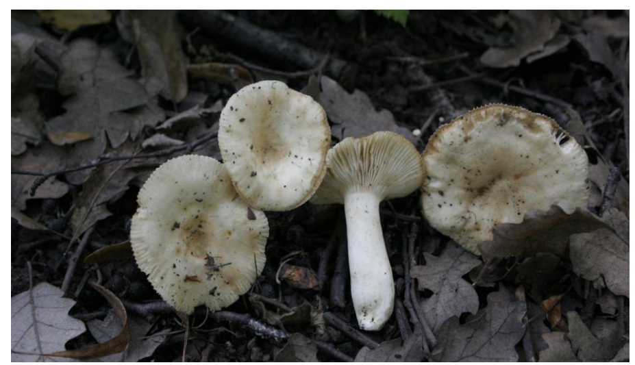
Fig. 8 Russula farinipes

An uncommon yet widespread species yet a new record for the Heath proper (I have only recorded this from Kenwood before now) and the first time I have seen it occur in this particular location over at least a decade. A mycorrhizal species recorded associating with Hornbeam. There are currently 318 records of this on the FRDBI with only four of those (mine) coming from Middlesex.