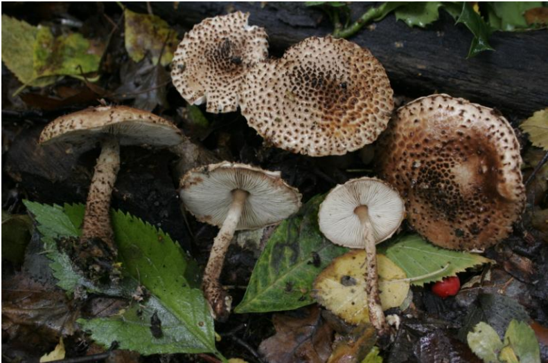
Fig 7. Echinoderma echinaceum

A rather uncommon to rare yet widespread species with only one previous record for Middlesex from Perivale Woods in 1981. A new record for Hampstead Heath. A saprophytic species preferring rather nutrient rich soils. Recorded here among dead wood and soil in a small copse of elm and birch tree. The FRDBI currently holds 114 records.