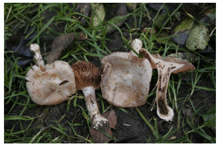
Fig.5 Cortinarius urbicus

A very rare species, new to site and county. A mycorrhizal species recorded associating with either Salix or Betula at the eastern margin of the Vale of Health Pond. Currently just 6 records on the FRDBI.