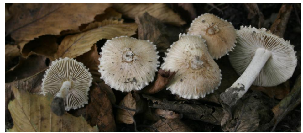
Fig. 6 Inocybe appendiculata

A very rare species, reported from England and Scotland but unsubstantiated with voucher material, new to site and county. A mycorrhizal species with various broadleaved deciduous trees. Recorded close to both Lime and Hornbeam. Currently there are just 14 records on the FRDBI.