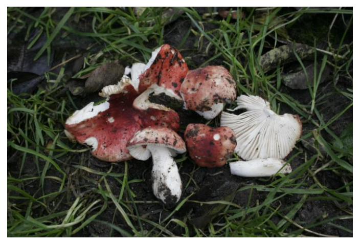
Fig 4. - Russula rhodomelanea - © Andy Overall

A very rare species new to site and county, mycorrhizal and associating with Carpinus betula, Hornbeam, just east of the Mixed Bathing Ponds. With only 9 records currently in the FRDBI*. * Fungi Records Database of Britain and Ireland.