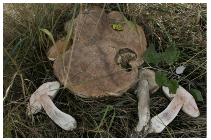
Fig. 10 Leccinum duriusculum

This species has been included on the recent Boletaceae Red Data List as Near Threatened (NT). Its 'precautionary' inclusion has arisen from uncertainty regarding population estimates from 97 unique georeferenced sites. A very healthy population thrives amongst a small population of Poplar trees at the north-west corner of the East Heath car park. It is mycorrhizal with various Poplars and Aspen. There are currently only 254 records in the FRDBI.