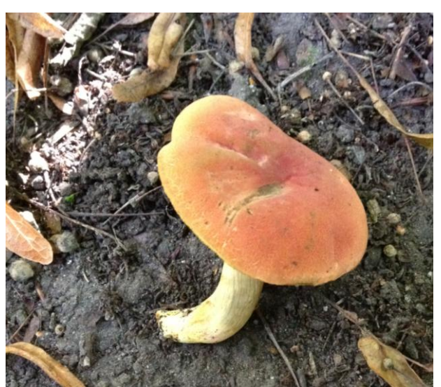
Fig. 9 Xerocomellus bubalinus

This species has been entered as Red Data Species due to the fact that it was described in 1991 and only recently recorded from GB in 2007 so it is listed as Data Deficient (DD) in the recent Boletaceae Red Data List produced by the JNCC. It is proving to be quite common on forays that I lead in Middlesex, so I should imagine that this status will change over the coming years. The same can be said of Xerocomellus engelii with regard to its red data entry and its regularity upon my foray lists but the same cannot be said of Xerocomellus ripariellus which is proving to be much rarer and therefore may stand as a more genuine red data candidate.